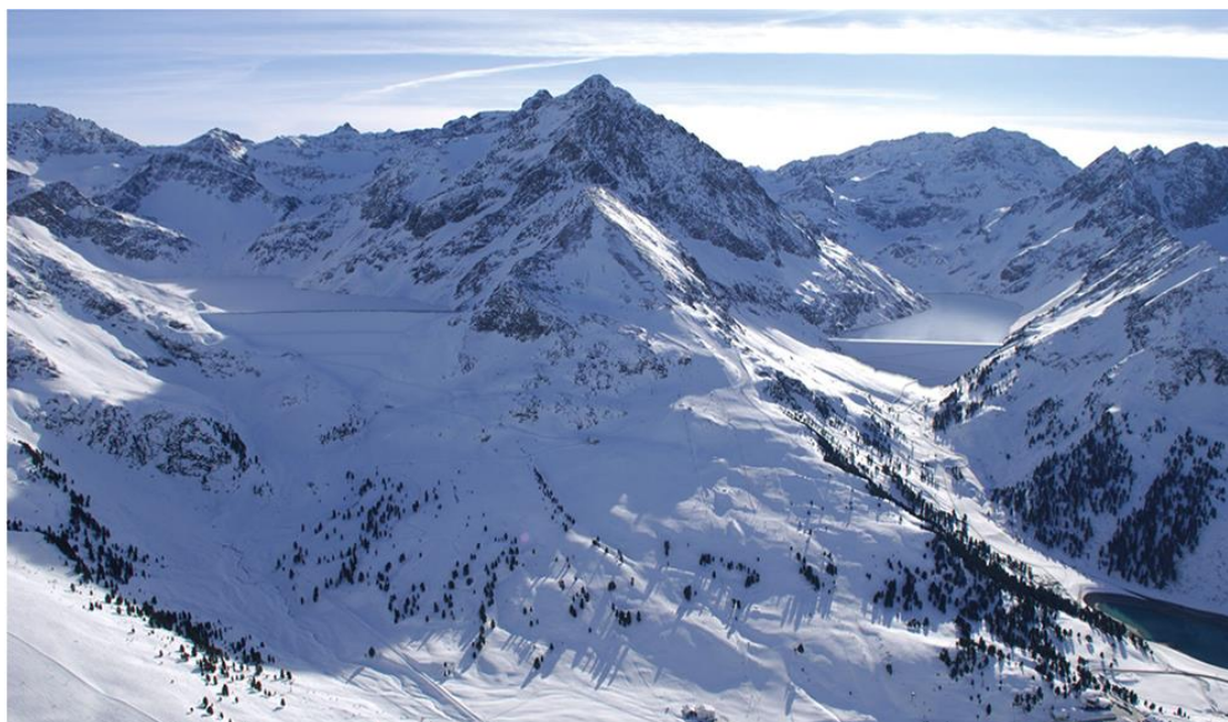
Planned Kühtai reservoir and dam